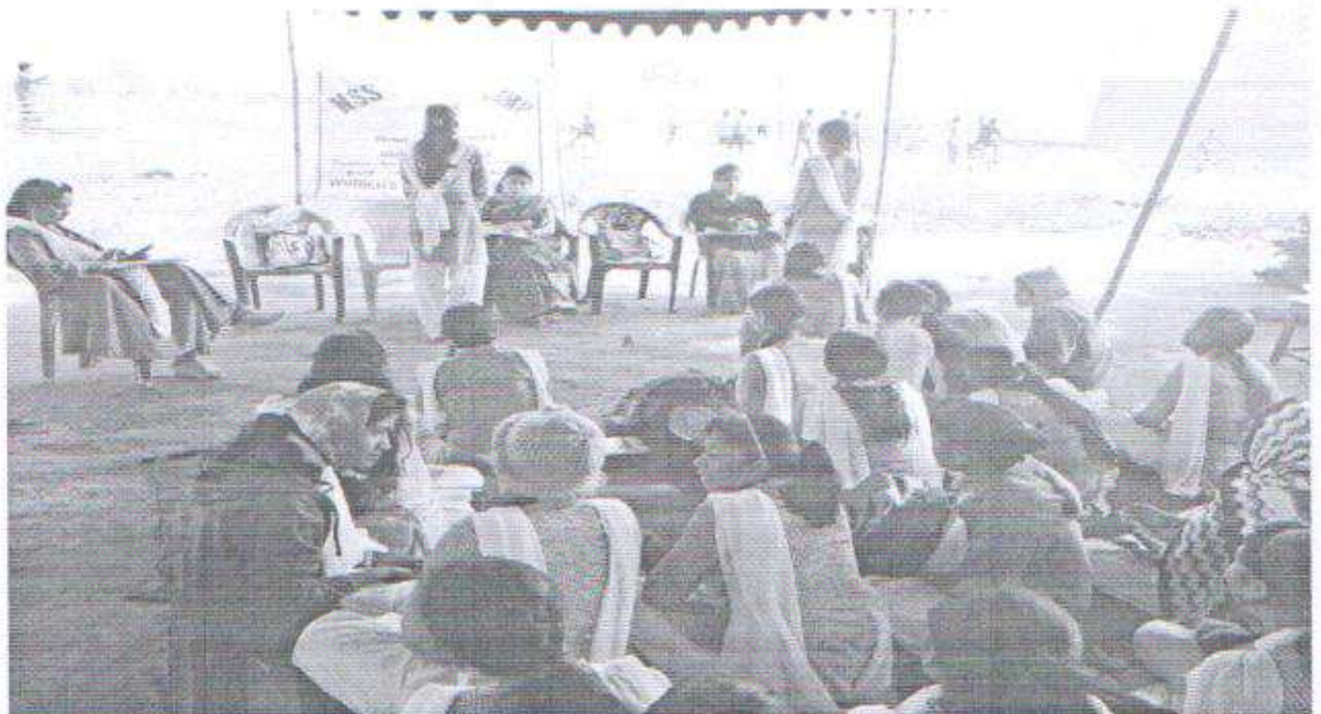
Quiz competition and debate competition was held during the special camp