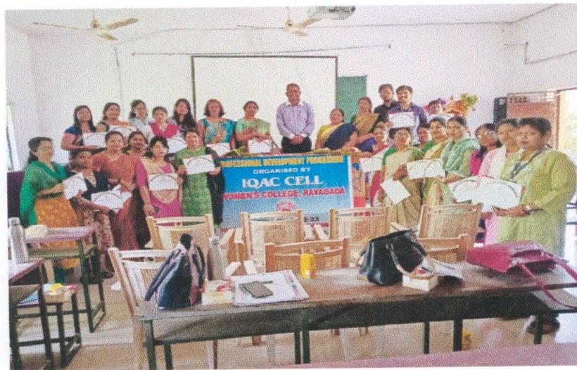
Certificate distributed to both teaching and non teaching staff.